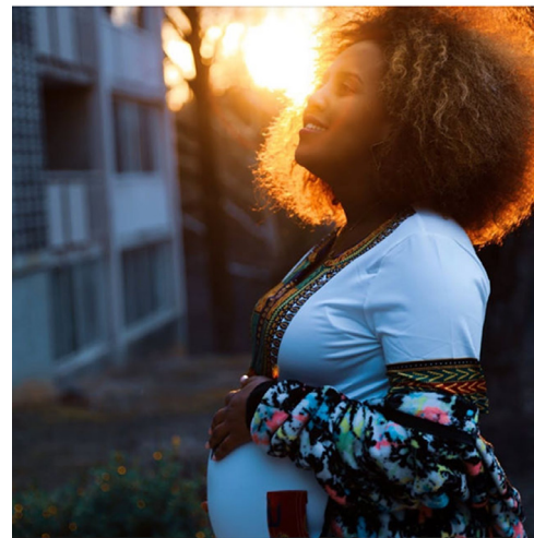
Fig. 1. Sample advertisement for recruitment on Facebook.

Tell us about your current reproductive health experiences and earn up to $40 by participating in research conducted by UCSF